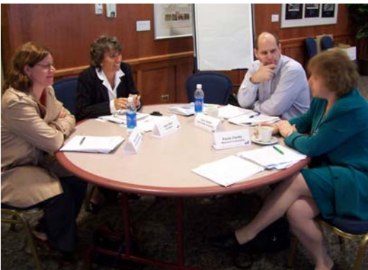
during intern training on May 30th & 31st.